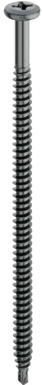
Enlarged to show detail.