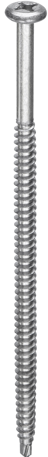
Enlarged to show detail.